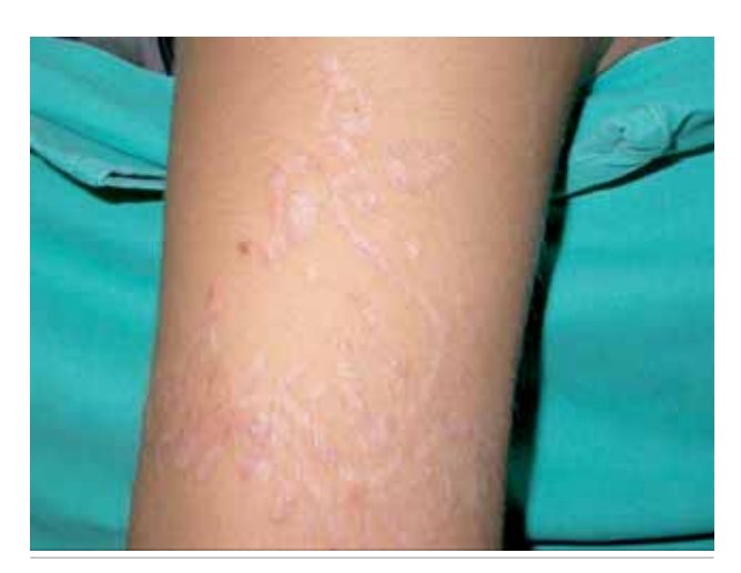
Figure. Postinflammatory hypopigmentation following the original design of a henna tattoo.

Patch testing was performed 6 weeks later with the GEIDC (Spanish Contact Dermatitis Research Group) standard series, 3 types of commercial henna powder (10% aqueous solutions),