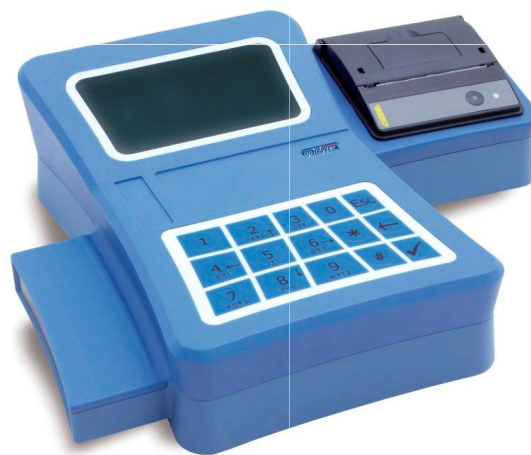
Figure 1 Reader opTrilyzer® Plus

opTrilyzer® Plus is a mobile measuring device for the quantitative evaluation and documentation of ALFA (Allergy Lateral Flow Assay) and AI-LFA (Autoimmune Lateral Flow Assay), rapid tests for the determination of sIgE (ALFA) and Pr3 and MPO (AI-LFA)