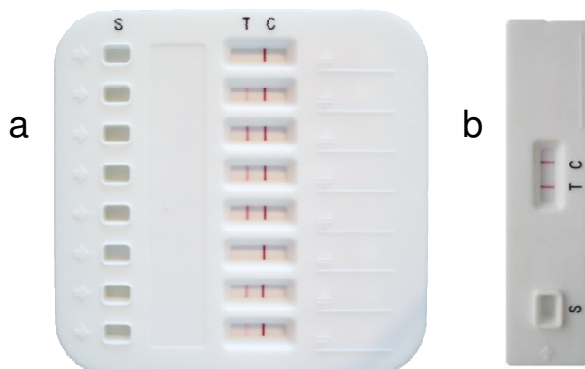
Figure 3 a) different results (eight-strip cassette); b) positive result (single-strip cassette)